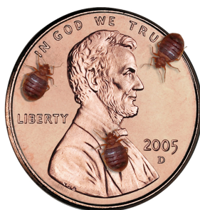
The size of an adult bedbug compared with a US penny

Bed Bug infestations have become a serious problem in the United States. Here are some FAQs: